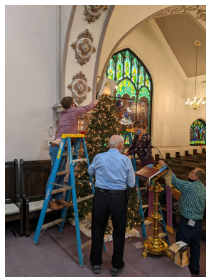
Decorating the sanctuary for Advent and Christmas