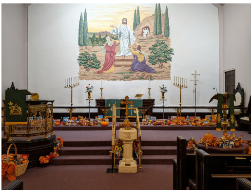
Harvest Home Sunday